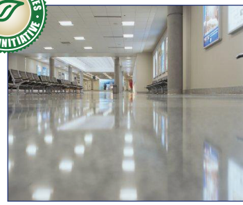
Periodic damp mopping with SUN-GLO RAIN will considerably extend the life of your floor finish.